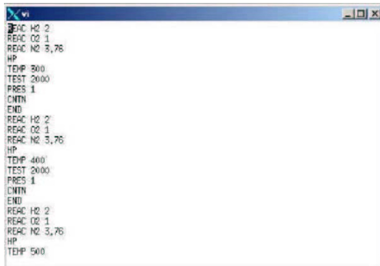
Figure 4 Gas_equil.inp

6) Next, you need to generate Gas_equil.inp. When you click the edit button in Equil, you will see Figure 4.