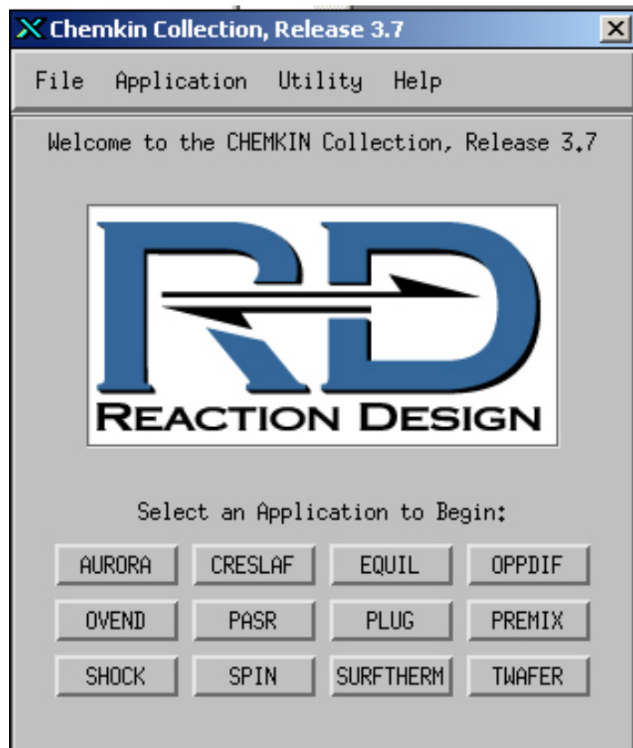
Figure 1 Chemkin window