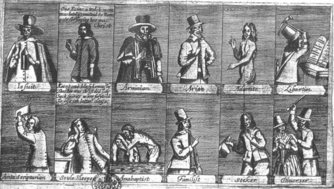
This image is in the public domain.