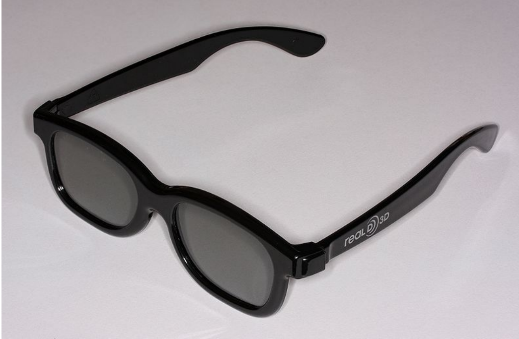
Figure 3: A pair of Real D 3D glasses. © D-Kuru/Wikimedia Commons. CC BY-SA. This content is excluded from our Creative Commons license. For more information, see http://ocw.mit.edu/fairuse .

3. You are given a pair of Real D 3D glasses. Determine which eye has the right-handed circular filter, and which eye has the left-handed circular filter. You will have access to two waveplates (a half-wave plate and a quarter-wave plate) specified for 532 nm, but it's up to you to figure out which is which.