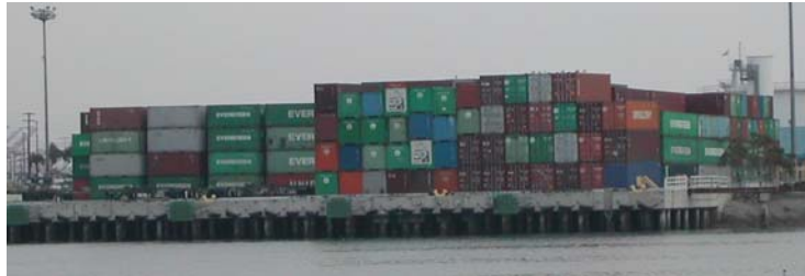
Container Storage (Fearing 2002)

The cranes grasp the ends of each container and place the container on a truck. The truck transports the container within the pier's storage area. Containers are held on the pier until designated outbound transportation for the containers arrive at the pier.