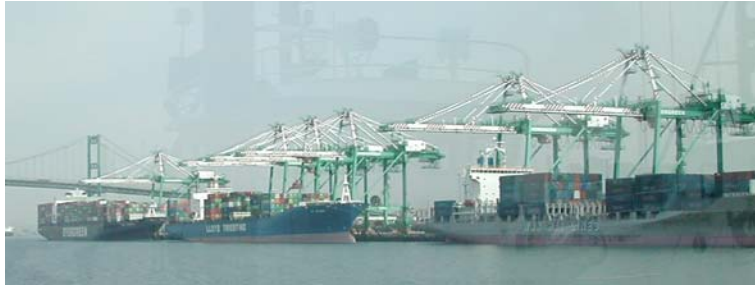
Ships, containers and cranes (Fearing 2002)

imports and exports are processed through containers (Sussman 264). Upon a ship's arrival at a berth, the containers and other cargo are unloaded by cranes.