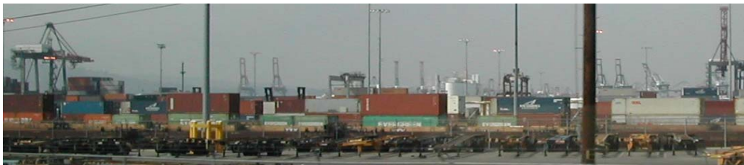
Containers stacked double-high on outbound train (Fearing 2002)

Before leaving the pier, containers must clear US Customs for security purposes. Due to the high volume, only a small portion of the containers are actually physically examined (I was unable to find actual statistics on this process), but paperwork is processed to record all import and export freight traffic. Containers are transferred via truck to their outbound truck or train for transport across the country.