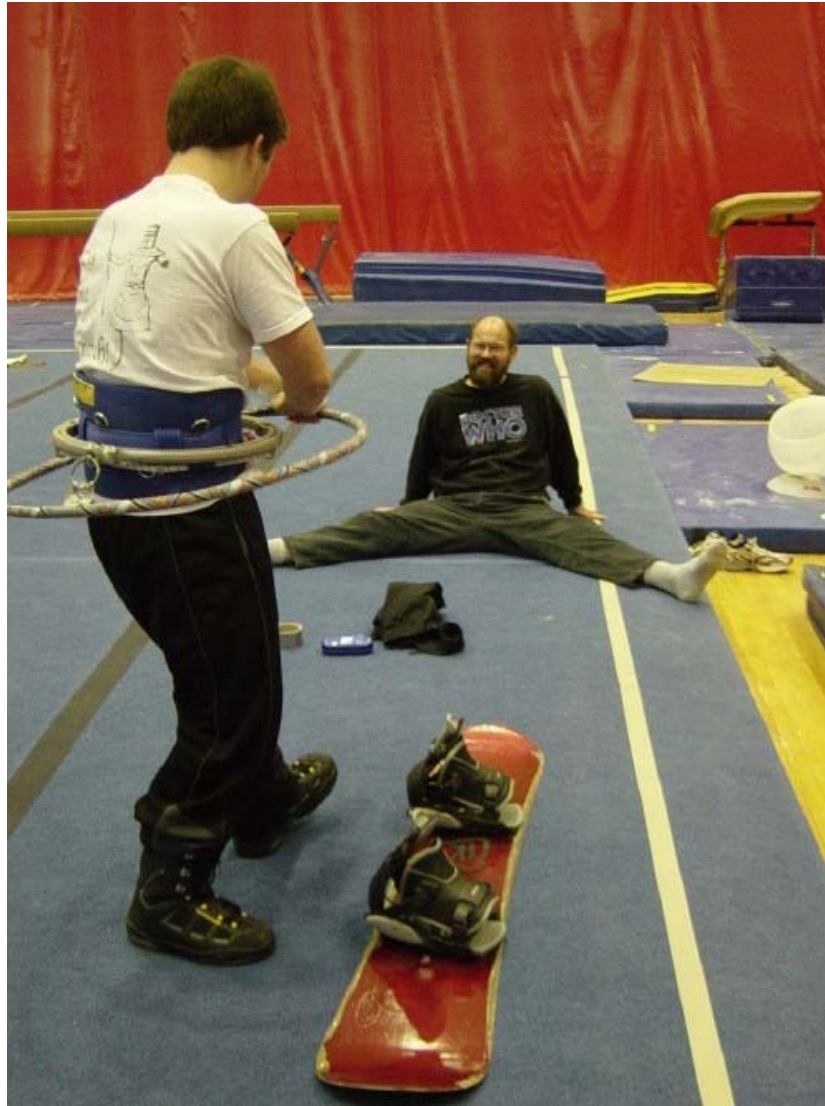
Tyler: Snowboard Training Harness

Simple single-point shockcord harness system allows dryland training of aerial snowboarding skills.