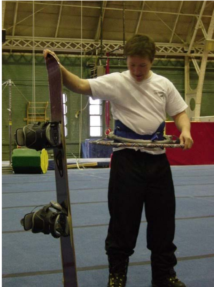
Tyler: Snowboard Training Harness

Simple single-point shockcord harness system allows dryland training of aerial snowboarding skills.