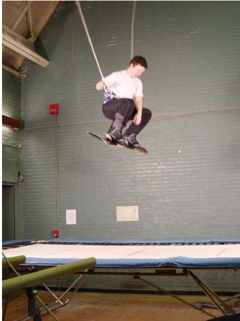
Tyler: Snowboard Training Harness

Simple single-point shockcord harness system allows dryland training of aerial snowboarding skills.