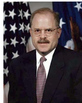
Michael E. Ryan General, USAF Chief of Staff